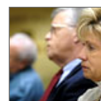
Candlelight vigil for victims